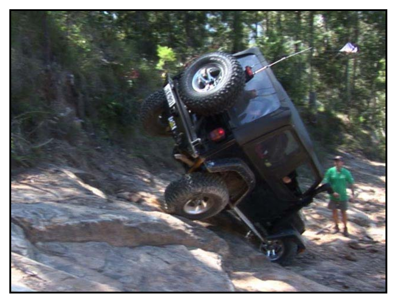
CHECK OUT THE TANGLE WARREN GOT THIS BLOKE INTO. GOOD ONYA WAZ.