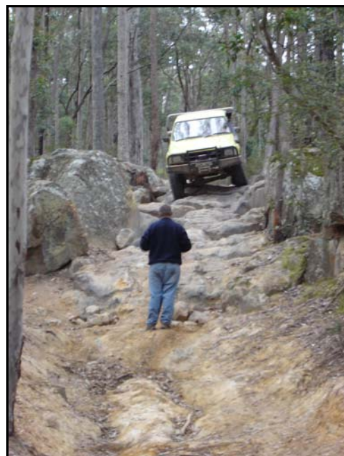
LITTLE BOY LOST

Everybody agreed that we'd found a new track that we'd have come back and tackle in the other direction. At last something positive had come from the weekend for me.